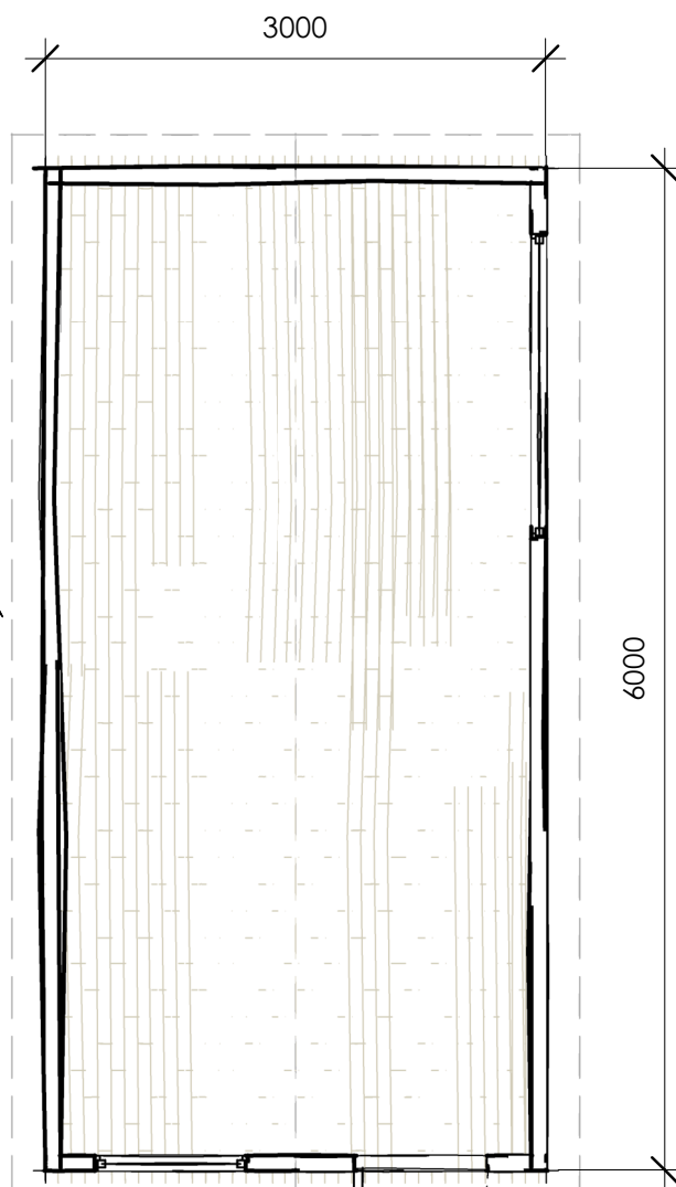
1 Floor Plan 1 : 50